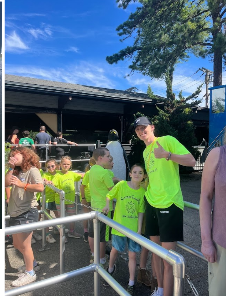
Camp Coolio bus ride fun