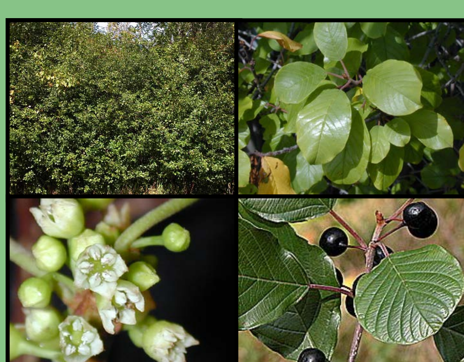
Glossy buckthorn ( Frangula alnus )