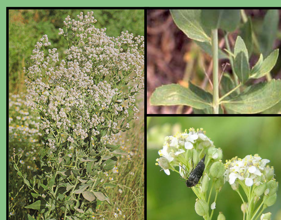
Perennial pepperweed ( Lepidium latifolium )