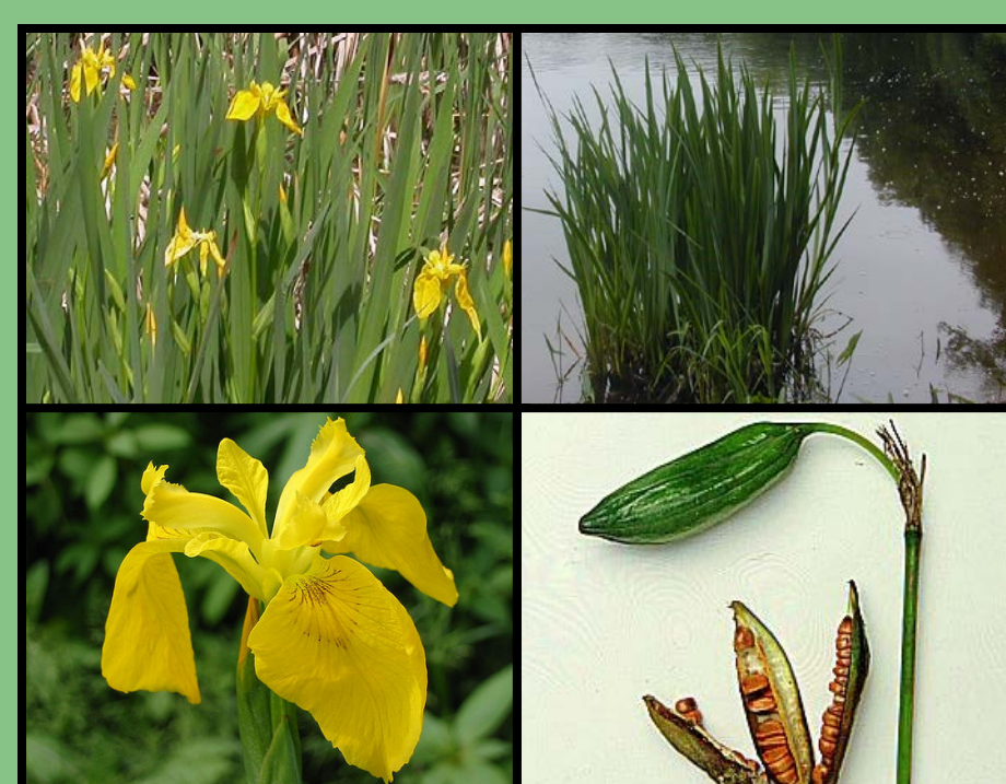
Yellow flag iris ( Iris pseudacorus )