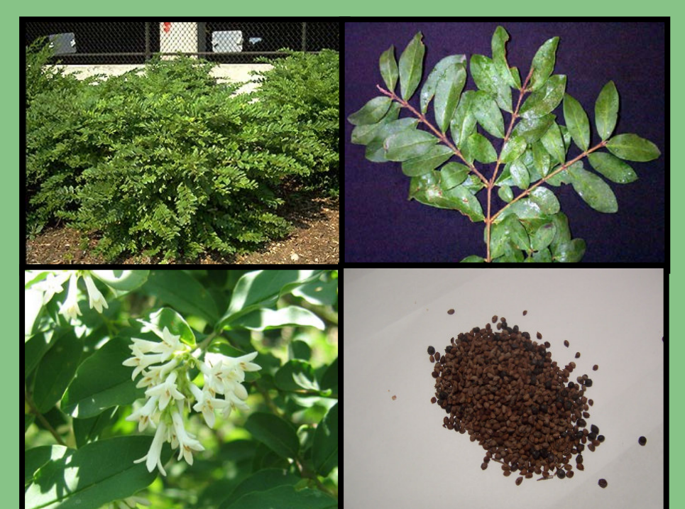
Blunt-leaved privet ( Ligustrum obtusifolium )