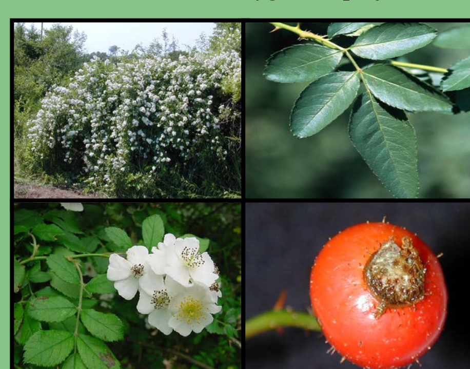
Multiflora rose ( Rosa multiflora )