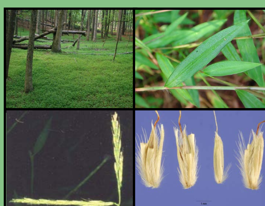
Japanese stilt grass ( Microstegium vimineum )