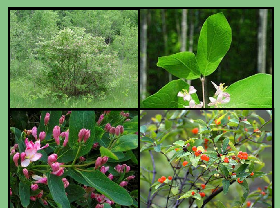
Tatarian honeysuckle ( Lonicera tatarica )