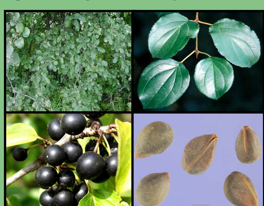
Common buckthorn ( Rhamnus cathartica )