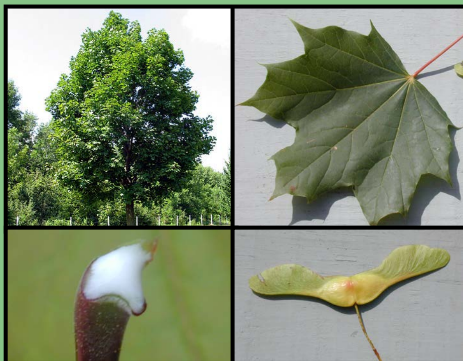
Norway maple ( Acer platanoides )

Department of Agriculture, Markets & Food, Division of Plant Industry