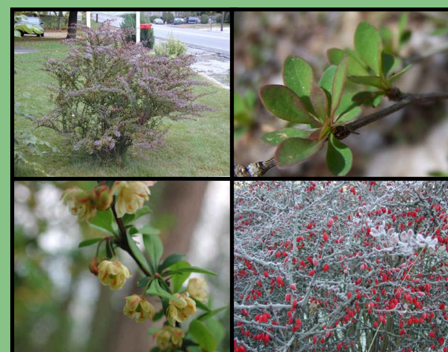
Japanese barberry ( Berberis thunbergii )