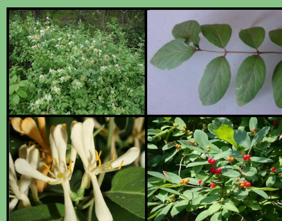
Morrow's honeysuckle ( Lonicera morrowii )