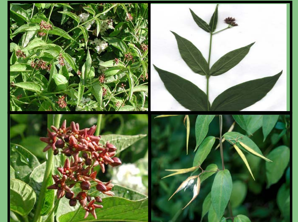
Pale swallow-wort ( Cynanchum rossicum )