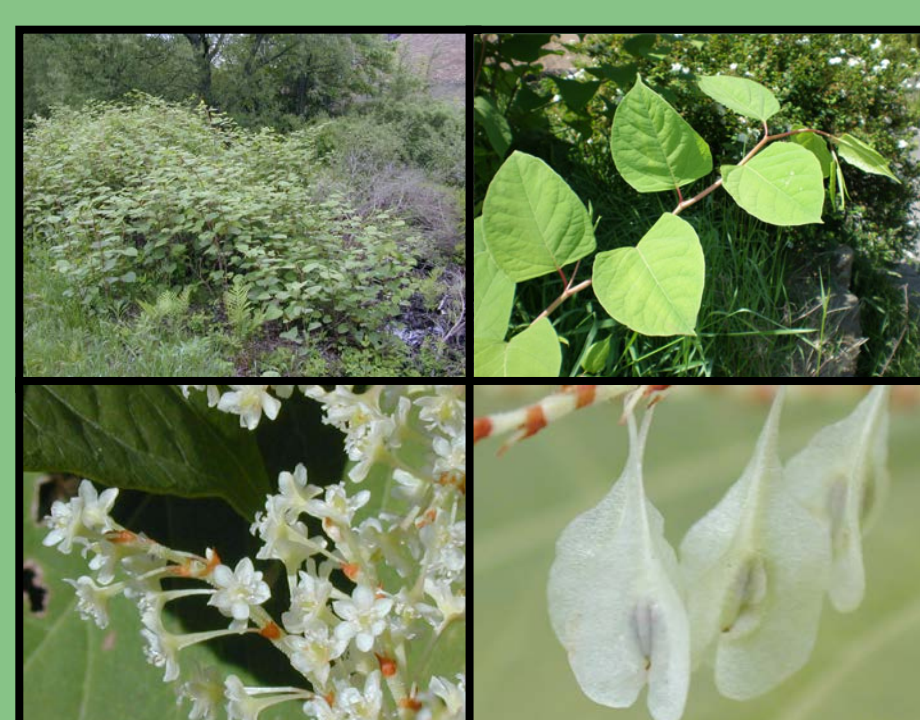
Japanese knotweed ( Polygonum cuspidatum )