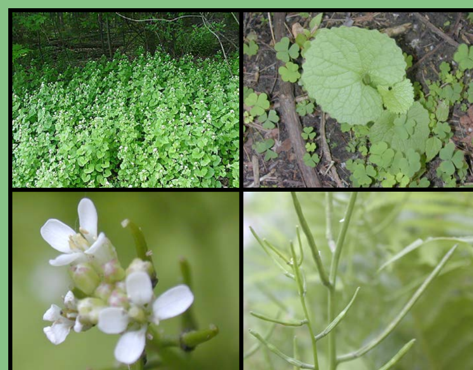
Garlic mustard ( Alliaria petiolata )