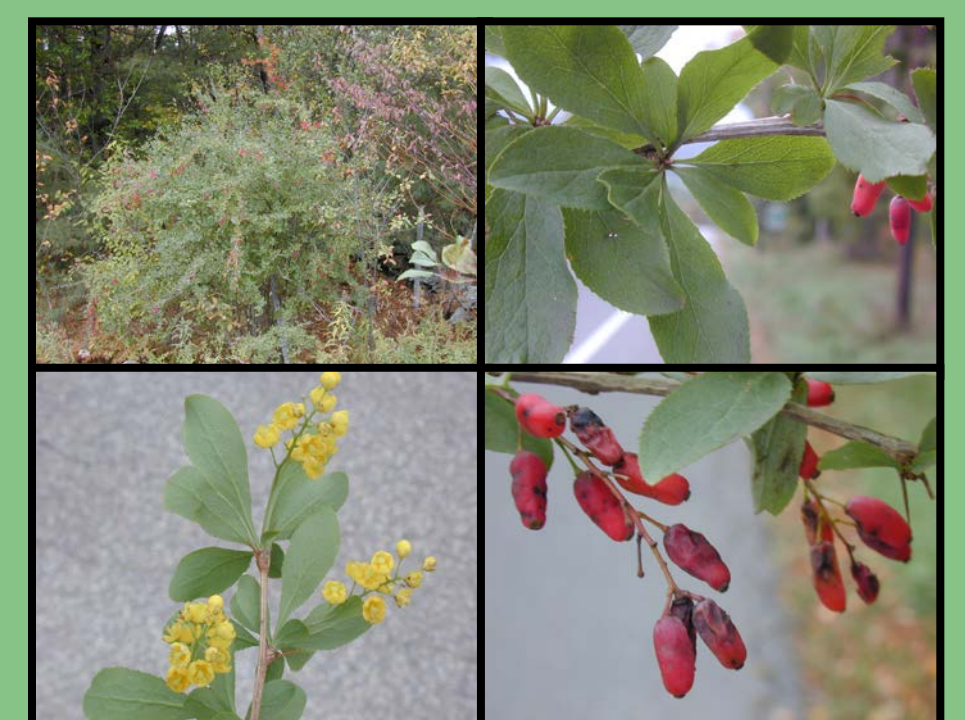
European barberry ( Berberis vulgaris )