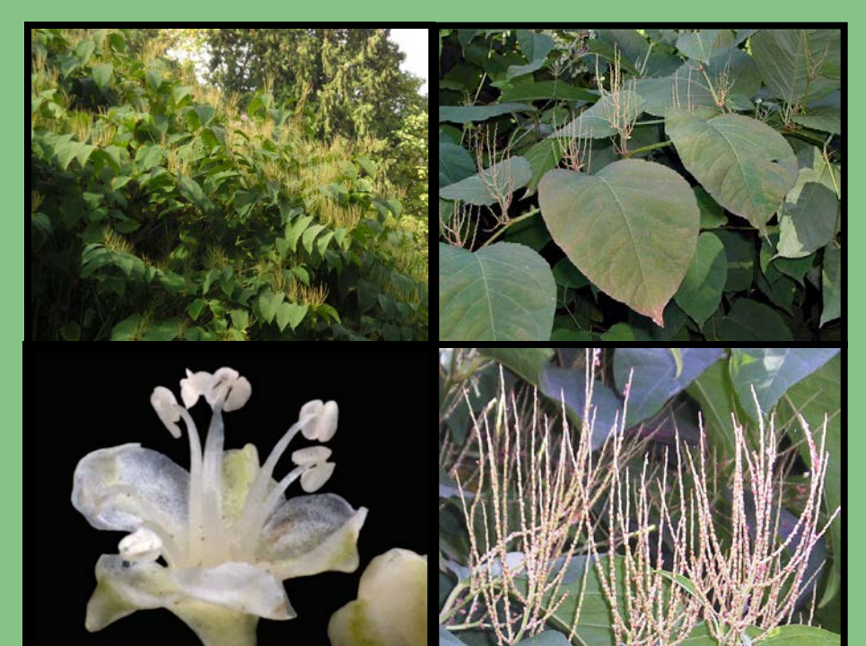
Bohemian knotweed ( Polygonum x bohemica )