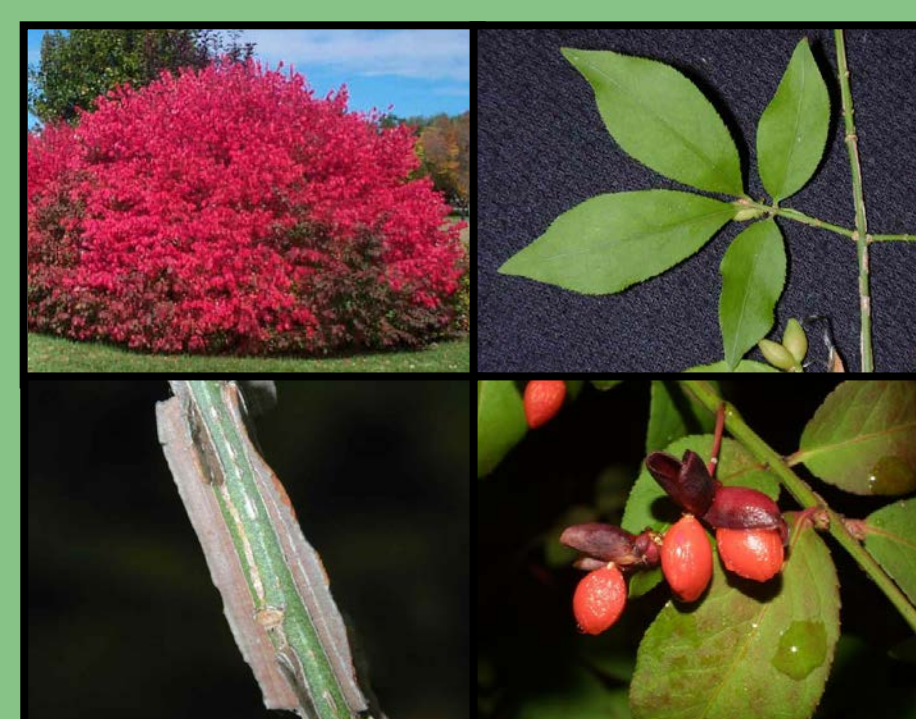
Burning bush ( Euonymus alatus )