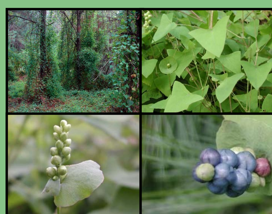
Mile-a-minute vine ( Polygonum perfoliatum )