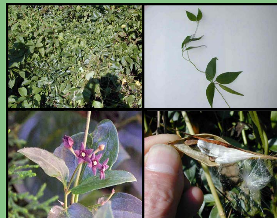
Black swallow-wort ( Cynanchum nigrum )