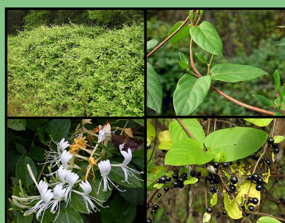
Japanese honeysuckle ( Lonicera japonica )