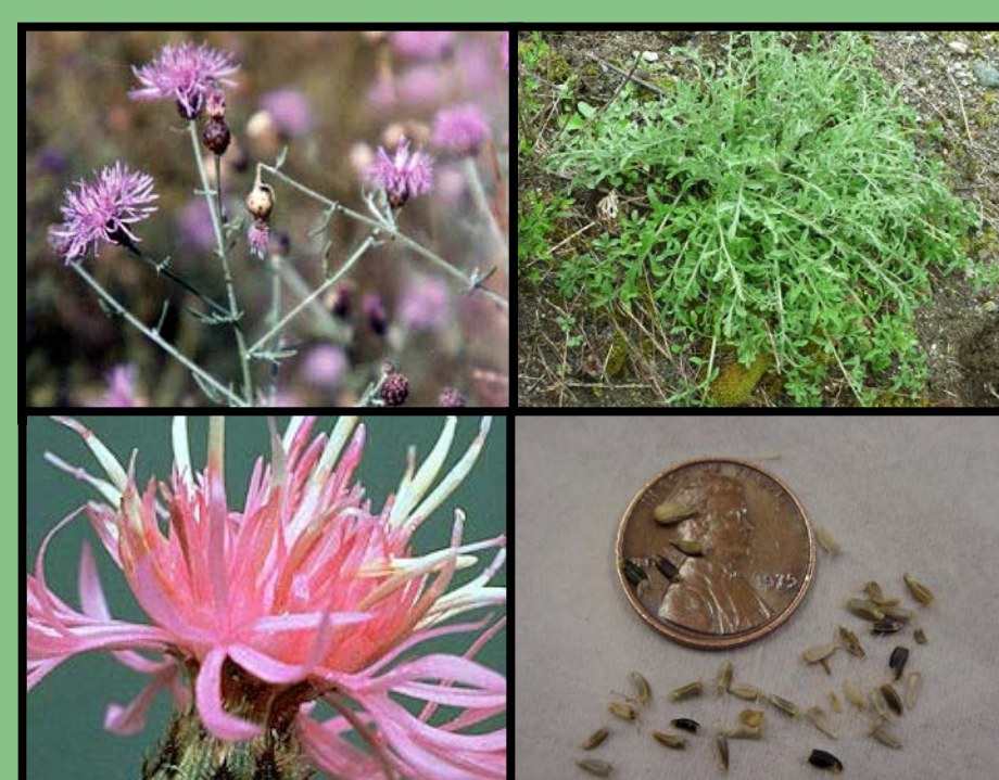
Spotted knapweed ( Centaurea biebersteinii )