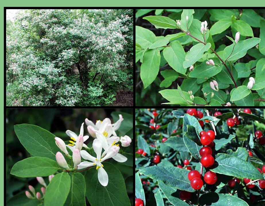
Showy bush honeysuckle ( Lonicera x bella )