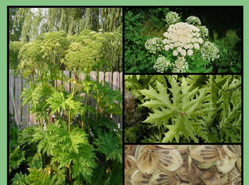
Giant hogweed ( Heracleum mantegazzianum )