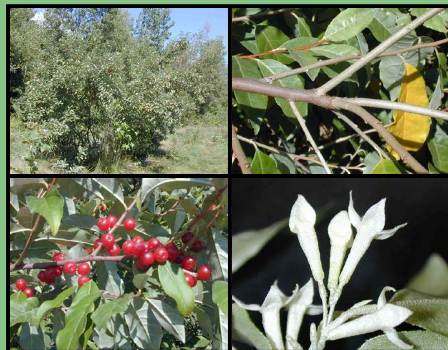
Autumn olive ( Elaeagnus umbellata )