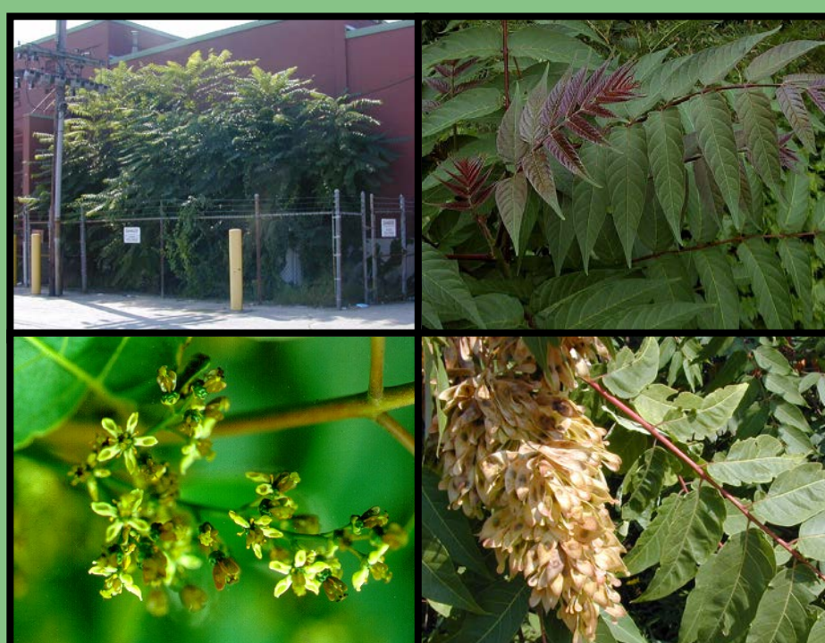
Tree of heaven ( Ailanthus altissima )