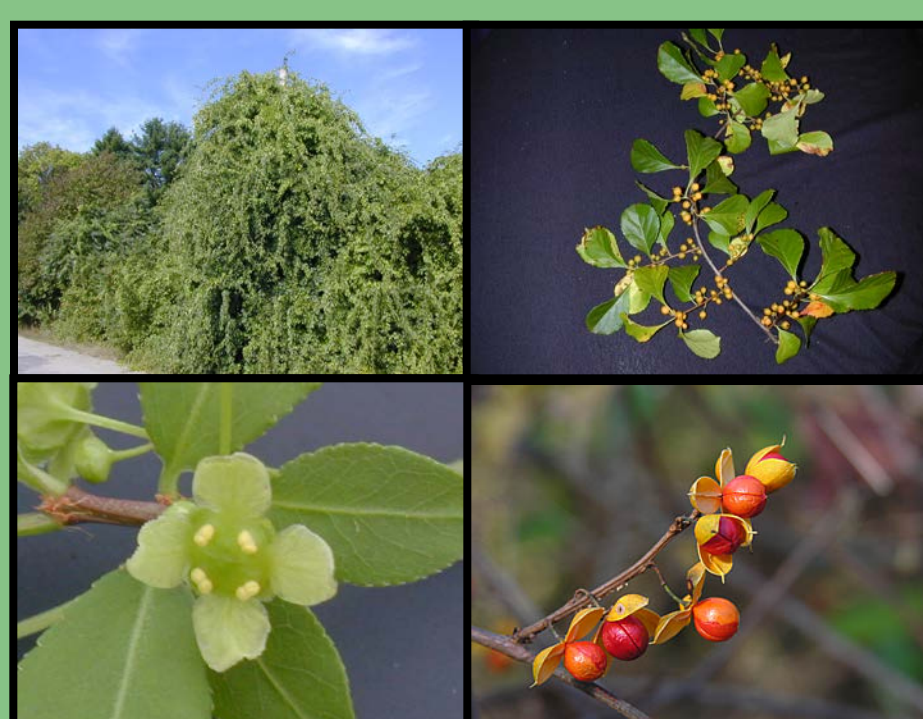
Oriental bittersweet ( Celastrus orbiculatus )